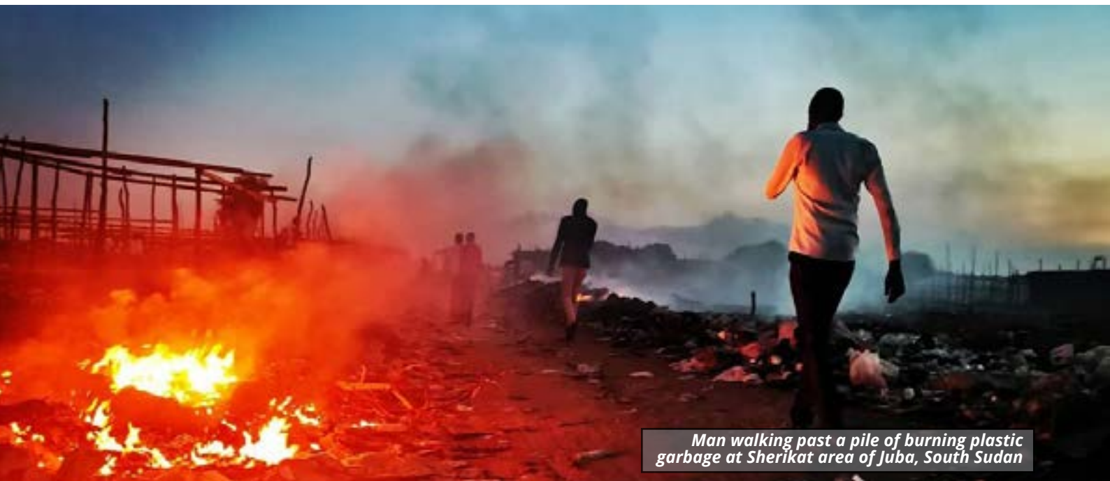
Man walking past a pile of burning plastic garbage at Sherikat area of Juba, South Sudan

In this report, the HRDs working on refugee rights are those HRDs who took up human rights work once they left South Sudan and who were motivated to document, report and denounce human rights violations as a result of their experiences.