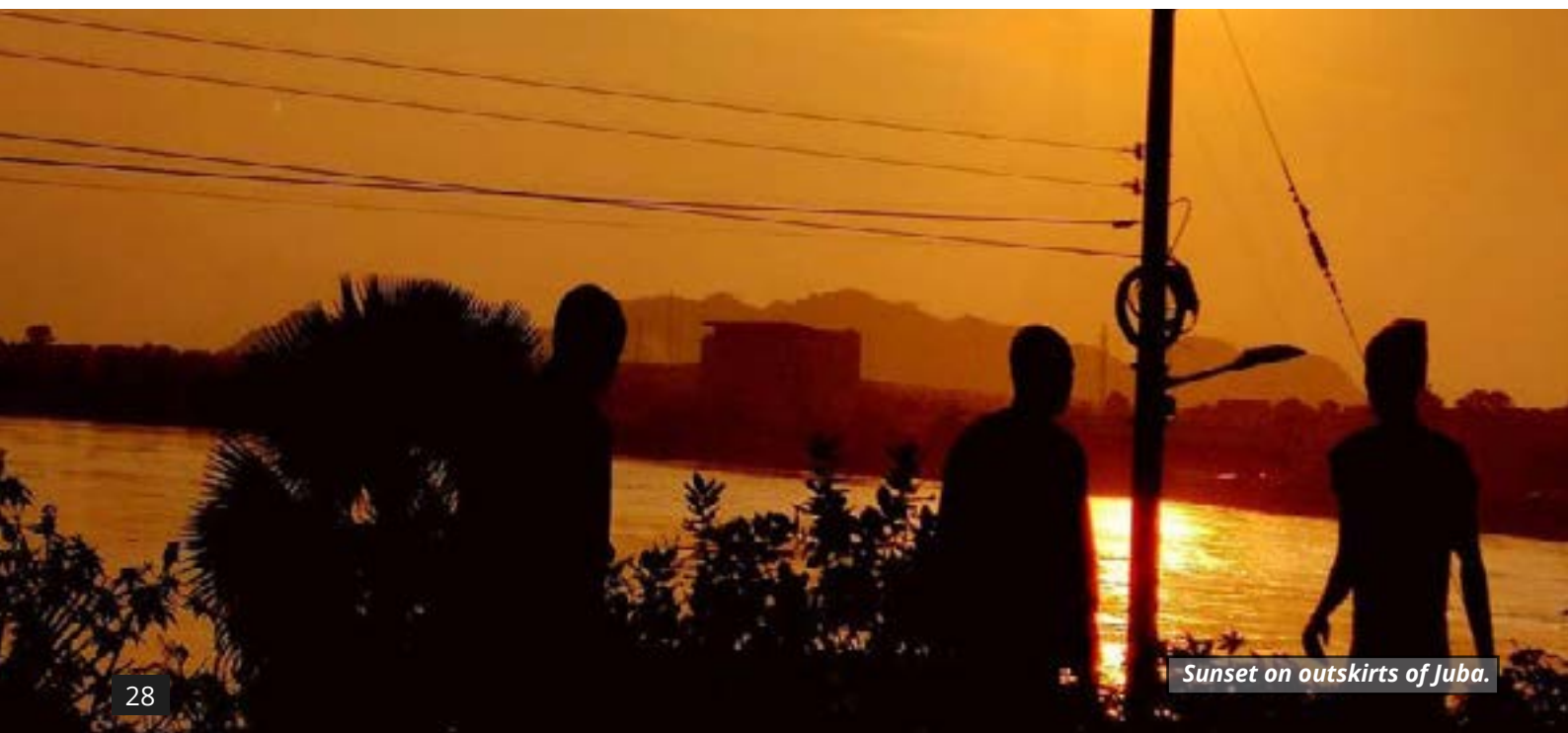
Sunset on outskirts of Juba.