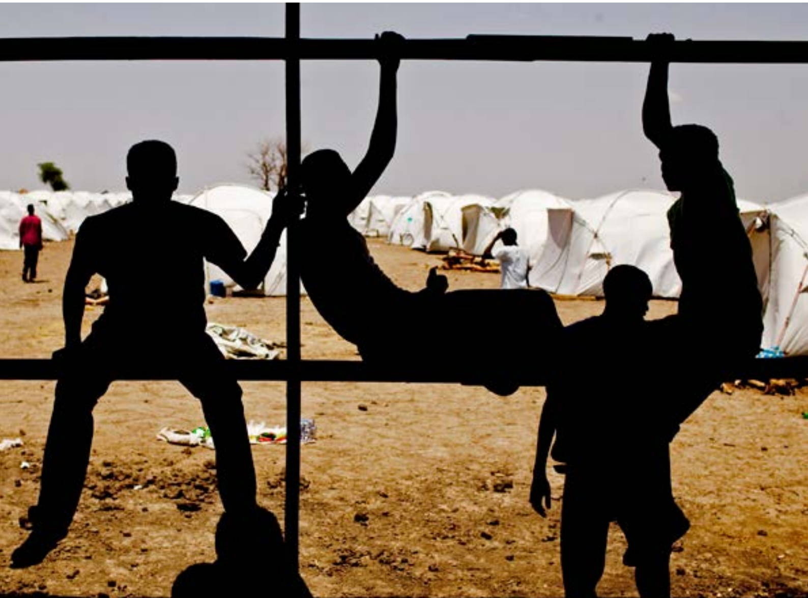
Young men catching shade in the heat of the day at a displacement camp in South Sudan.