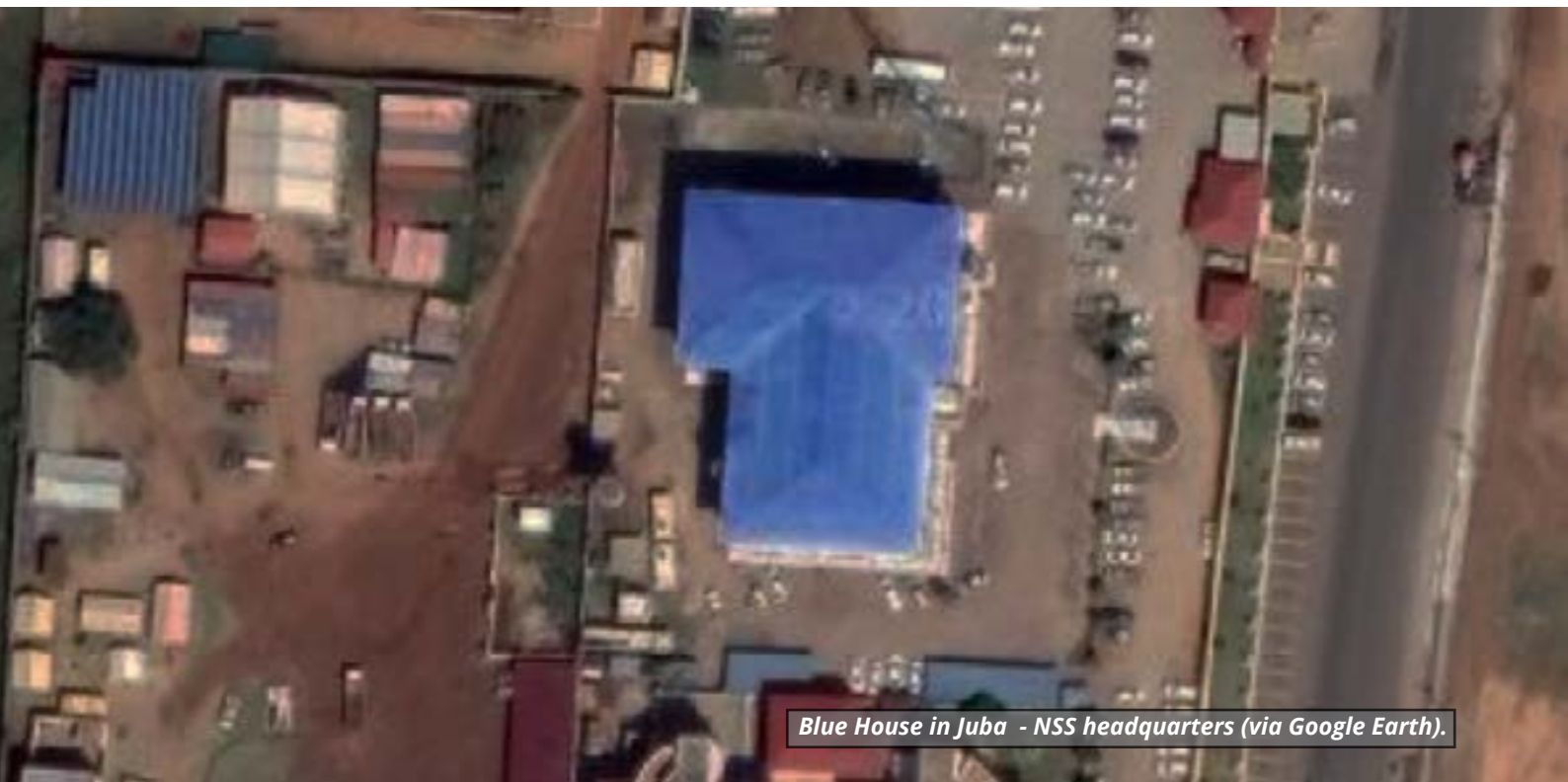
Blue House in Juba - NSS headquarters (via Google Earth).