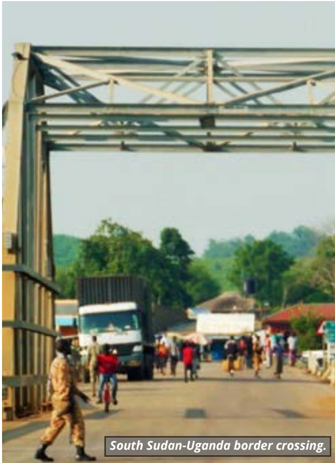
South Sudan-Uganda border crossing.