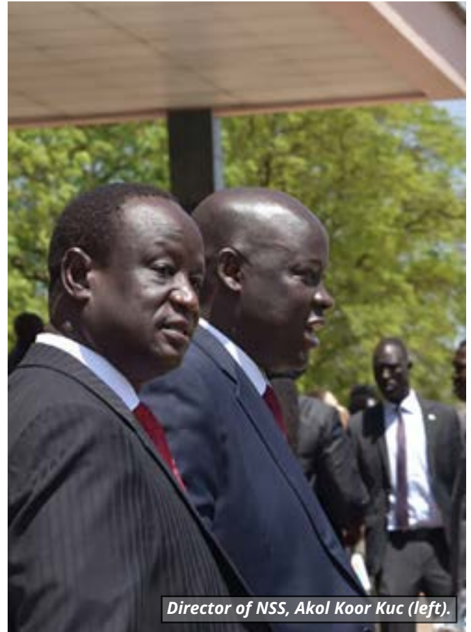
Director of NSS, Akol Koor Kuc (left).