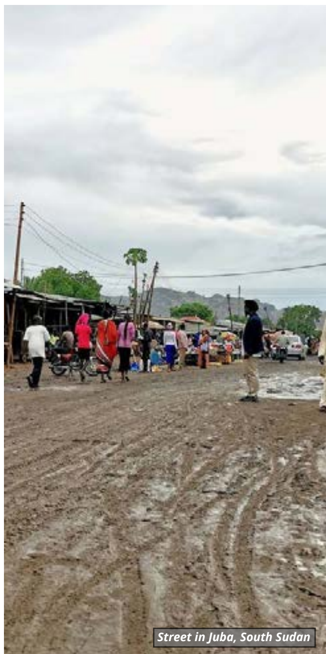
Street in Juba, South Sudan

Refugees are supposed to be safe from persecution once they leave the country where they were persecuted. They are meant to be protected under the principle of