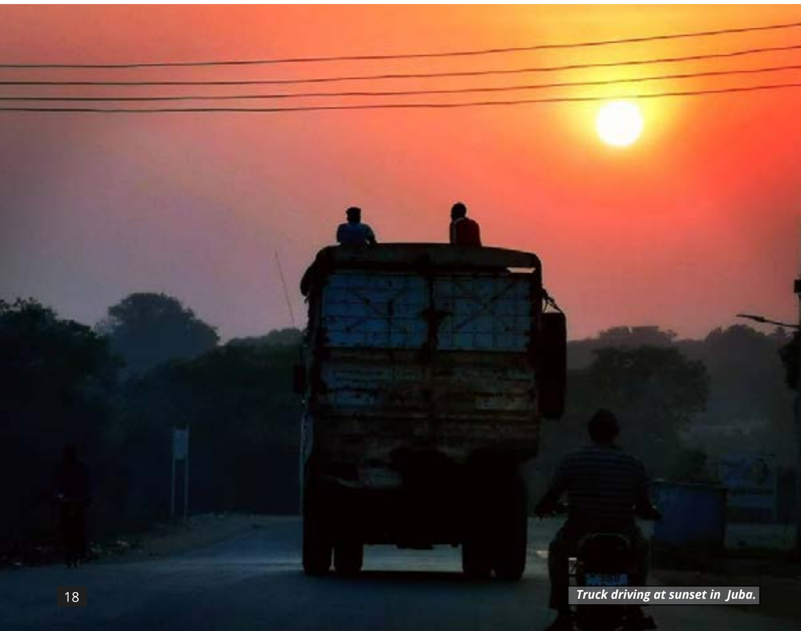
Truck driving at sunset in Juba.