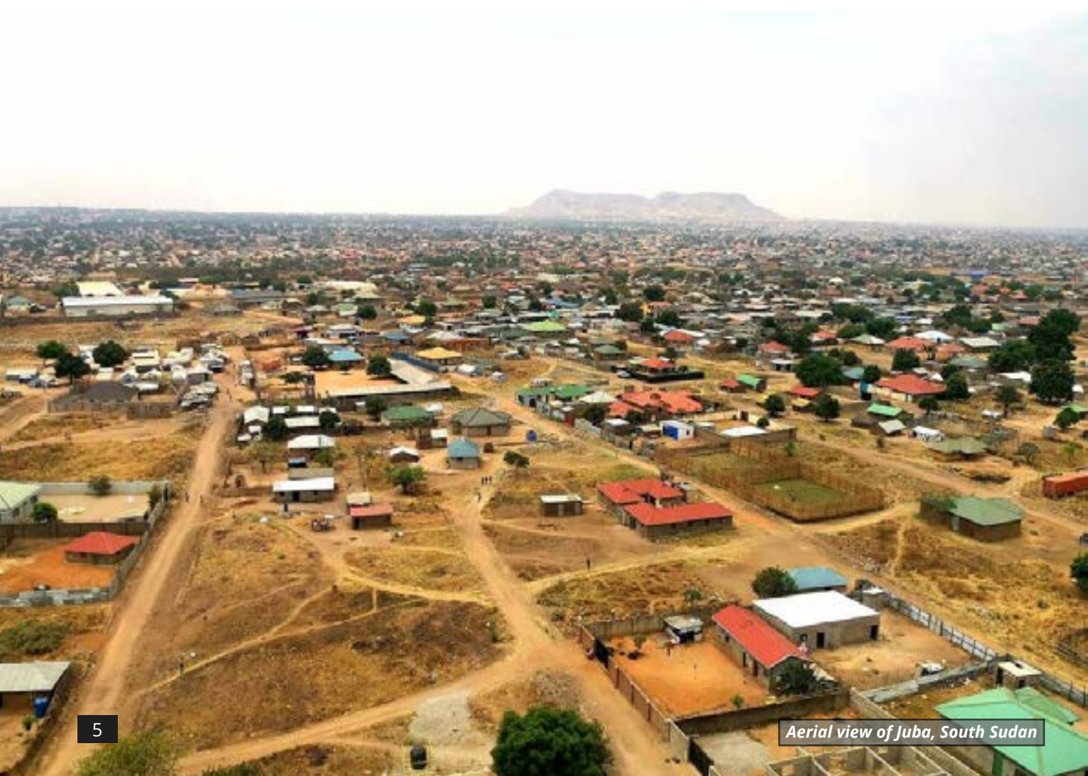
Aerial view of Juba, South Sudan

The majority of cases documented in this report refer to incidents that happened outside of South Sudan, mostly in Kenya and Uganda. Two incidents reported took place inside South Sudan, and they are the reasons why HRDs fled the country. They are included here to provide a more comprehensive view of the power of harassment and intimidation of the South Sudanese NSS, and to showcase some of the reasons why South Sudanese need to leave their country. 2