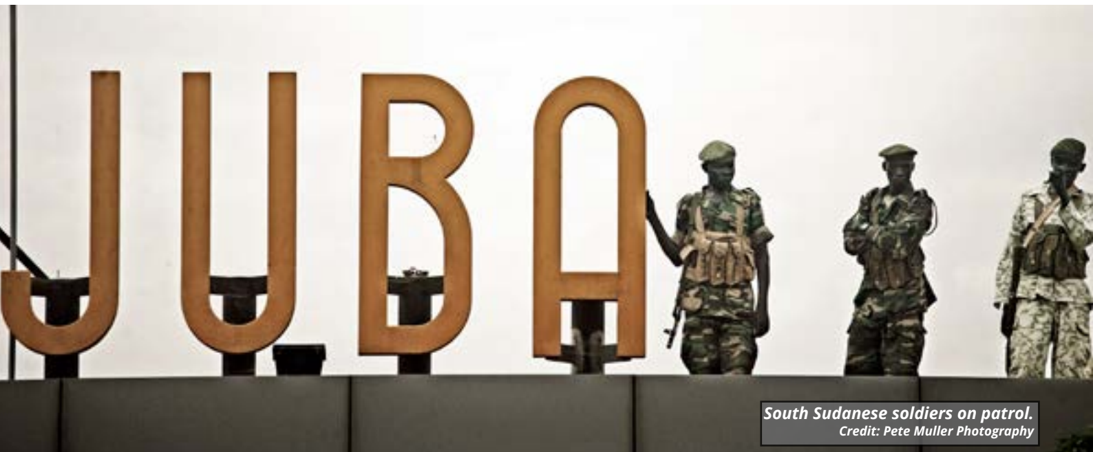
South Sudanese soldiers on patrol.